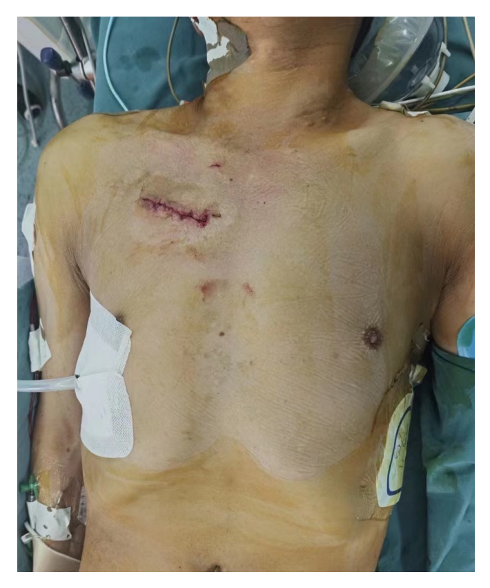
Fig. 2 - Surgical opening length.