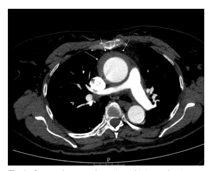
Fig. 1 - Computed tomography angiographic image showing type A intramural hematoma.

Patients who underwent aortic surgery were included in the study. TA-IMH was defined by the absence of an intimal tear in computed tomography (CT) angiography. Patients who had elective aortic valve repair and replacement were excluded. Unstable patients whose neurological examination could not be performed because of cardiac arrest were excluded from the study. Radiologists diagnosed the development of cerebral