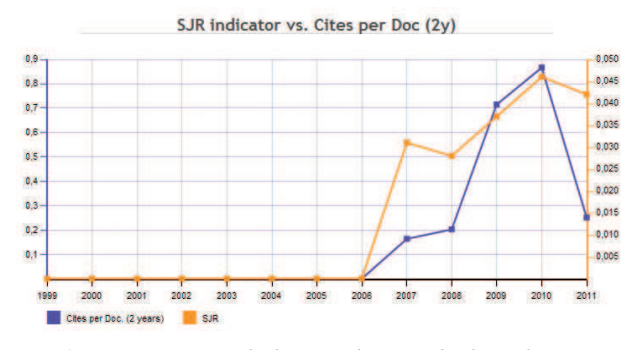
Fig. 1 - SCIMAGO graph showing the growth of articles citations of BJCVS

Between the 8<sup>th</sup> and 11<sup>th</sup> November, I participated in the XIII National Meeting of Scientific Editors of ABEC (Brazilian Association of Science Editors) in Gramado, RS. The central theme was "Ethics and Integrity in Scientific Publications'. The discussions were very rich on this issue, because the lack of ethics in science is a stain that must be resisted at all costs. The editors of scientific journals should