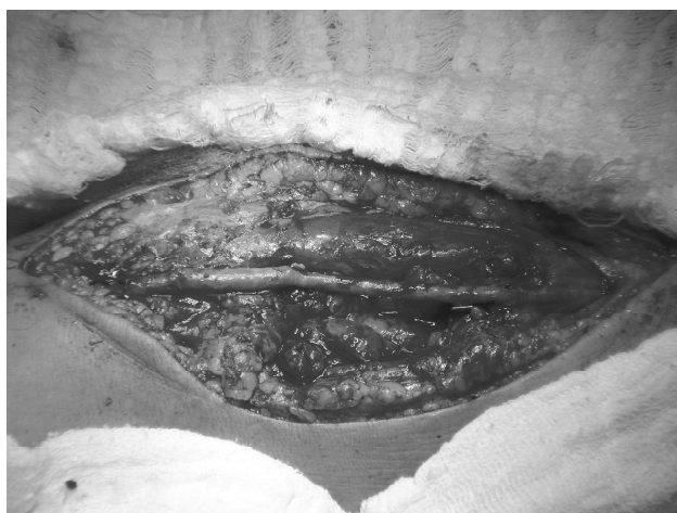
Fig. 3 - Final aspect after aneurysm resection and interposition reverse saphenous vein graft in brachial-radial location