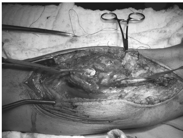
Fig. 2 - Image surgical aneurysm right brachial artery, compromising its bifurcation. It is heart repaired with tape on the right brachial artery proximal to the aneurysmal involvement

arteries. On histopathology, it was observed under the microscope: artery showing loss of elastic fibers of the middle layer associated with the deposition of mucoid substance; extensive hyalinization; adventitia with mild infiltration linfomolecular; vasovasorum thickening. Conclusion: Transformation of mucoid middle layer of the brachial artery aneurysm.